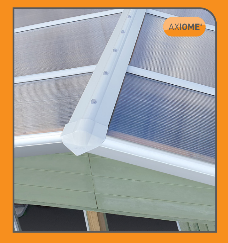
How 2 Cut Polycarbonate Sheets Video

Axiome<sup>®</sup> glazing sheets provide a lightweight and robust solution that can be used in many varied applications. Axiome<sup>®</sup> is manufactured in a huge range of sheet sizes to suit virtually every eventuality providing probably the widest selection of polycarbonate globally. The use of this versatile product is increasing all the time, due to its inherent properties which make it lightweight, flexible, strong, safe and provide an excellent light transmission. For roof glazing, Axiome<sup>®</sup> Polycarbonate Sheet provides peace of mind that it won't shatter and produce dangerous shards like glass in the event of impact.